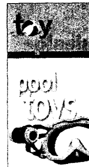
EXHIBIT NO. 9 Magedson 8-1-07